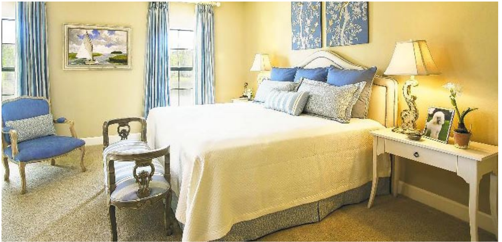
Special for Homes

In the San Jose floorplan, bedrooms are roomy and inviting. The well-appointed master suite boasts an en suite bathroom with a double vanity, granite countertops, stained wood cabinetry, a soaking tub and walk-in shower reminiscent of a peaceful spa.